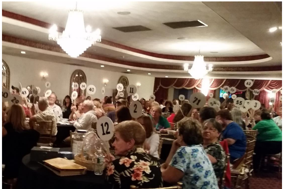
Quarter Auction at the Almond Tree Manor, Alpha, NJ